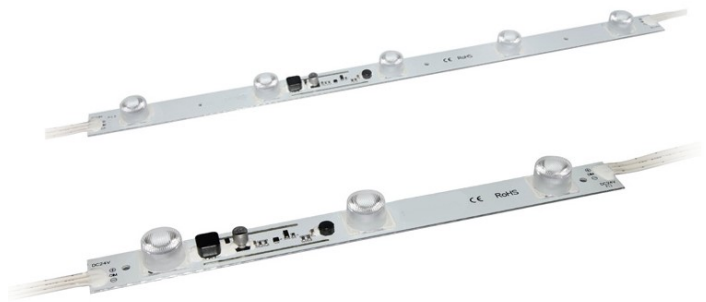
Edge lighting can be a very economical method of lighting sign boxes

Comprising high quality and efficient Cree LEDs combined with specially designed lens; these modules produce 30% more light per Watt than other similar looking products.